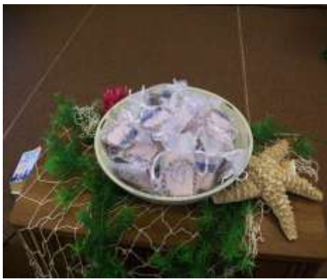
Our service project- bracelets! Reaching out to other women in need!

What a great retreat at the Streater Baptist Camp! There were around 50 women in attendance with lots of laughter, sharing, and worshipping God!